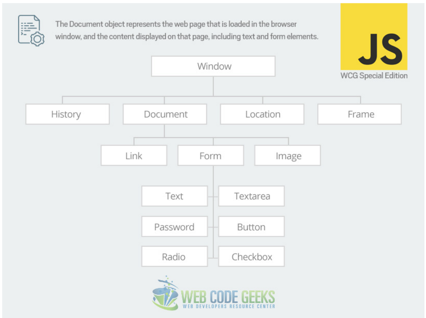
Figure 1.2: The Javascript Object Hierarchy

Properties define the characteristics of an object. Examples: color, length, name, height, width Methods are the actions that the object can perform or that can be performed on the object. Examples: alert, confirm, write, open, close .